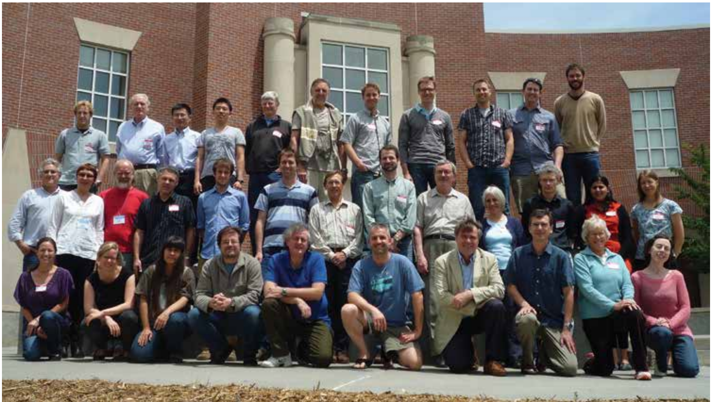
Figure 1. Group photo showing a majority of the participants from the GLTC workshop in June 2012, which was held on the campus of the University of Nebraska-Lincoln.

In addition to lake surface temperature, the GLTC database also